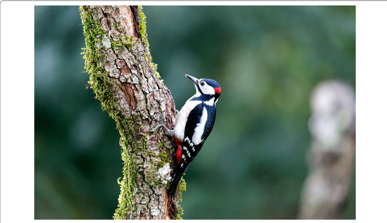
Fig. 8 Winner, Editor's Pick."Tree trunk of Quercus faginea Lam. subsp. broteroi (Cout.) A. Camus with the bryophytes Homalothecium sericeum (Hedw.) Schimp, Nogopterium gracile (Hedw.) Crosby & W.R. Buck and the great spotted woodpecker [(Dendrocopos major L., 1758)]. Location: Ourém. Portugal. 9-3-2016."

which generated an eerie image resembling a human face (Additional file 11).