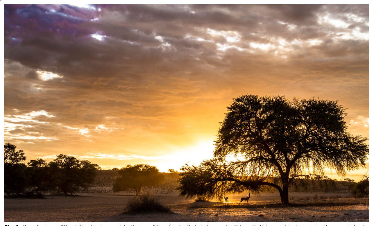
Fig. 1 Overall winner: "The striking landscape of the Kgalagadi Transfrontier Park during sunrise. This south African park is characterized by vast arid landscapes with red dunes, sparse vegetation and camel thorn trees."

the enlarged proboscis—big noses are funny across cultures and species!), the sociality of the animals, and the framing of bare earth, grass, and sky. But the underlying conservation story is also poignant. Saiga antelope populations have been decimated by hunting for their meat and horns—valued in Chinese medicine—dropping from a population of over one million in 1970s to approximately 50,000 today. Conservation efforts have stopped much of the hunting, but illegal poaching and highly-skewed sex ratios driven by culling the males for horns continue to threaten the species. The birthing season is a hopeful time for any conservation program, and it's easy to project hope onto the animals seen here."