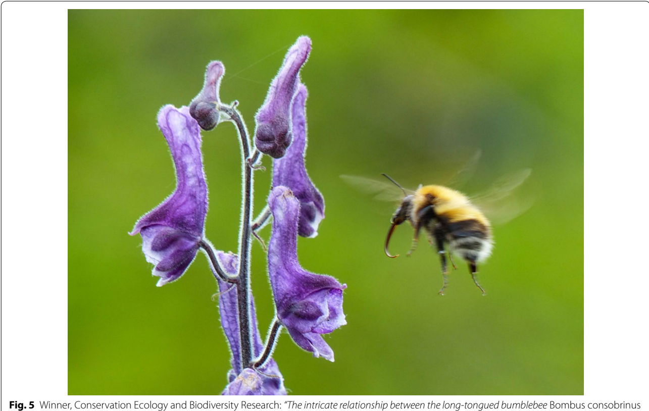
Fig. 5 Winner, Conservation Ecology and Biodiversity Research: "The intricate relationship between the long-tongued bumblebee Bombus consobrinus and the perennial herb Aconitum lycoctonum is a wonderful example of co-evolution. B. consobrinus is specially adapted to feed on A. lycoctonum's long-spurred flowers and only exist within its range. A. lycoctonum, likewise, depends on the visits of B. consobrinus for pollination. There are cheaters in this system, however. A. lycoctonum is frequently subjected to nectar robbery by short-tongued bumblebees. They cannot reach the nectar the usual way, so instead they bite a hole on top of the flowers with their jaws. These holes produced by nectar robbing bumblebees can be seen on the flowers in the bottom part of the photo."

(Additional file 4), and silhouettes of shearwaters above the sea break through a glowing Mediterranean horizon (Additional file 5).