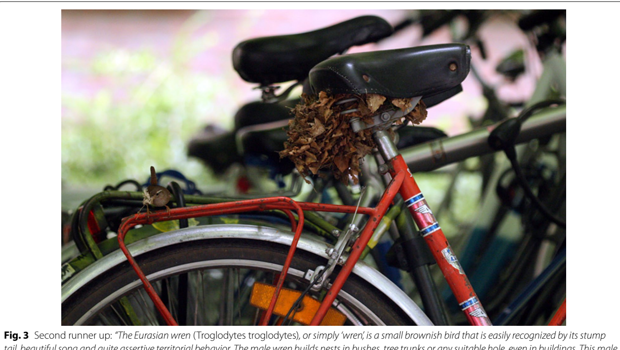
tail, beautiful song and quite assertive territorial behavior. The male wren builds nests in bushes, tree trunks or any suitable hole, even in buildings. This male wren, adapted to busy campus life, decided to build a nest under the saddle of a parked bicycle. The wren initially started to line the nest with soft material (pictured), and this is usually an indication that a female has chosen the nest for breeding. Despite efforts to avoid disturbance by biology students and staff using the parking lot, the nest remained unoccupied and finally was blown out during a spring storm."

Section Editor Josef Settele thought Elin's photo was a great visual reminder of the continued efforts for bee conservation: "The bumble bee picture was selected as it nicely represents the context of the very first assessment which was done within IPBES (the Intergovernmental Science-Policy Platform on Biodiversity and Ecosystem Services) [4], which dealt with pollination. This assessment was a major achievement on our road to bring biodiversity issue[s] much higher on the political agenda and rais[e] awareness at the UN level. More details of the report can be found here: http://www.ipbes.net/sites/default/files/ downloads/Pollination_Summary%20for%20policymakers_EN_.pdf."